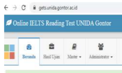
Figure 5. IELTS score

After the multimedia learning of web-based online test: IELTS academic reading test had been developed, evaluating the feasibility of the product prior being used in the learning process was implemented. Product feasibility evaluation known as formative evaluation consisted of 2 stages of testing: alpha testing (product validation) and beta testing (user impression). In the alpha testing, validation was mainly conducted by the testers who were internal media experts and IELTS expert. Material expert validation validated the suitability of the material content. Similarly, media validation aimed at evaluating aspects of display and media programs.