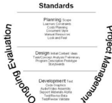
Figure 1. The Alessi and Trollip instructional system design model (2001)

continual iterative was implemented until the functionalities could be achieved (Por, Mustafa, Osman, Phoon, & Fong, 2020). The development meant flexible and the step depended on the previous step result. Another emphasis in Alessi & Trollip ISD model was project management in order to check the online test completed within the time, frame, and the allotted budget. Slippage could be covered while maintain the standards (Por & Fong, 2011). Alessi and Trollip model was illustrated in Figure 1 below.