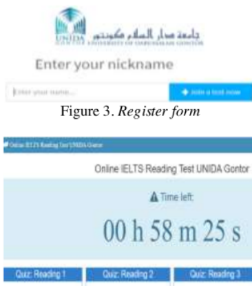
Figure 3. Register form

The web-based online test for academic IELTS reading test was set up through the PHP coding system or PHP programming and equipped with a website programmer, Adobe Flash CS 3 application, Adobe Photoshop CS3, Notepad ++, Corel Draw X4, and Adobe Illustrator. The initial stages of development began with preparing the academic reading material for the test and determining the display design together with menu content. Furthermore, web-programmers initiated the coding system process referring to the predefined flowcharts and storyboards. At this stage, Role Based Access Control (RBAC) was also established. In this multimedia web, user roles were divided into 3: administrator (web manager), lecturer, and user (learners or general users). After the coding and merging process of each media component was established, the server and website domain were settled: https://gets.unida.gontor.ac.id/pertanyaan/quiz as the address for the website being developed. The following was a profile of the web-page of web-based online test: