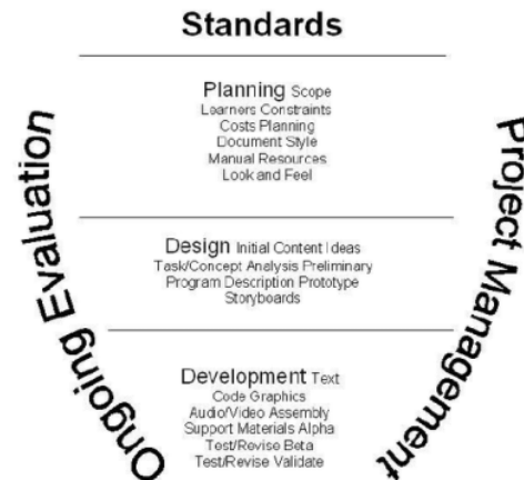
Figure 1. The Alessi and Trollip instructional system design model (2001)

continual iterative was implemented until the functionalities could be achieved (Por, Mustafa, Osman, Phoon, & Fong, 2020). The development meant flexible and the step depended on the previous step result. Another emphasis in Alessi & Trollip ISD model was project management in order to check the online test completed within the time, frame, and the allotted budget. Slippage could be covered while maintain the standards (Por & Fong, 2011). Alessi and Trollip model was illustrated in Figure 1 below.