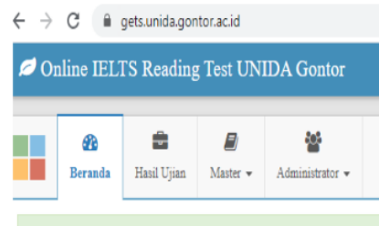
Figure 5. IELTS score

The web-based online test for academic IELTS reading test was set up through the PHP coding system or PHP programming and equipped with a website programmer, Adobe Flash CS 3 application, Adobe Photoshop CS3, Notepad ++, Corel Draw X4, and Adobe Illustrator. The initial stages of development began with preparing the academic reading material for the test and determining the display design together with menu content. Furthermore, web-programmers initiated the coding system process referring to the predefined flowcharts and storyboards. At this stage, Role Based Access Control (RBAC) was also established. In this multimedia web, user roles were divided into 3: administrator (web manager), lecturer, and user (learners or general users). After the coding and merging process of each media component was established, the server and website domain were settled: https://gets.unida.gontor.ac.id/pertanyaan/quiz as the address for the website being developed. The following was a profile of the web-page of web-based online test: