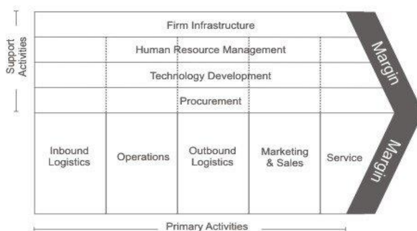
Figure 1: Porter's Generic Value Chain

Global value chain also part concept of supply chain. Although there are some definition of value chain own: Value chain analysis is a technique widely applied in the fields of operations management, process engineering and supply chain management, for the analysis and subsequent improvement of resource utilization and product flow within manufacturing processes (Womack, 1990).