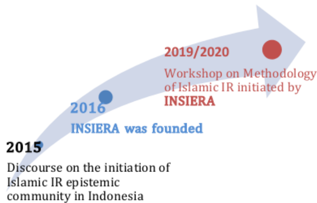
Picture 1. The Development of Islamic Perspective in International Relations, Roadmap by Insiera 2016-2020

The results of the workshop can also be compiled into books and then recommended within the scope of the IR Study Program especially if it can be adopted for the development of teaching and research curriculum for lecturers and students. This systematics is expected to introduce Islamic International Relations as a methodology or just a discussion discourse.