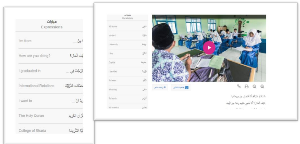
Image 4 Vocabularies and idioms attached in Learning. Aljazeera. Net

Fifth, Learning Aljazeera.Net is equipped by vocabularies and idioms according to the themes of conversation, which both of them are important in listening practice. Having vocabularies and expressions will help learners to improve their language skills<sup>44</sup>. The vocabularies and idioms provided in this website are also discussed along with their meanings in English. Indirectly, this encourages Arabic and English language skills simultaneously.