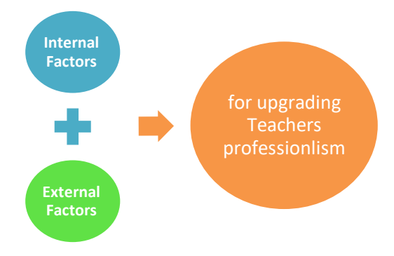
Picture 2. Motivational Factors for Upgrading Teacher Professionalism at KMI Gontor for Girl 1 Sambirejo, Mantingan, Ngawi

Motivational factors for upgrading the professionalism of teachers at the Darussalam Islamic Boarding School differentiates between the two: the first, internal factors, and the second, external factors. First, the internal factors are the factors of the teachers themselves and may include psychological factors, then thinking factors of the learner. Secondly, the external factors are the factors obtained from outside the teachers, that is also the ultimate driving factors for upgrading the professionalism of the teachers at Darussalam Islamic Boarding School Gontor for Girls, first campus.