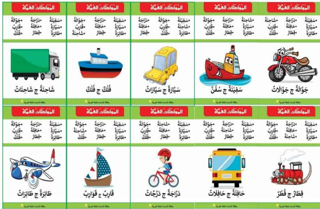
Picture 2. The Sample of the Themes of the Flashcard

The above picture highlights the whole vocabulary in one theme. Every flashcard is designed differently based on the themes so that every theme has its own colour of card. Therefore, the student can recognize them easily. The theme "fil-madrasah", for instance, has 9 vocabs related to it with different pictures for each vocabulary. But pertaining to the colour, it has a similar green and red-combined main background. It shows that this colour combination is used for this theme. The colour may be different to the rest of the themes.