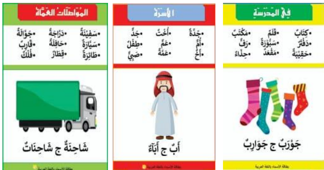
Picture 1. The Single Flashcard

The card contains four main parts; the first is the theme of the card at the top of it. It shows the card identity to the users and making it easy for them to identify what the card is about. The second is the list of the vocabularies. It shows all the vocabs that the students will have to understand and memorize in the same theme of the card. Next, the third part is the picture that dominate the card's space purposely to help the student understand the meaning of the vocabulary faster. And the last is the Arabic vocab that is written precisely under the picture.