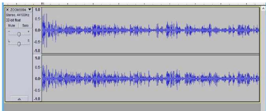
Figure 1. Audacity software to edit audio recording

The steps to make audio podcast are; transfer the audio files from the sound recorder to a computer. Then, create a backup of these unedited files. next open the audio files with Audacity, save file as a new project file. next, edit the audio, finally export audio file into MP3 files.