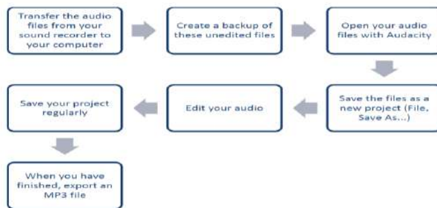
Figure 2. The steps on making audio podcast

The other step is to produce audio podcast are the publisher needs to create audio file. This needs to be in mp3 format and can be created using software such Microsoft sound recorder. Then, create the RSS file for