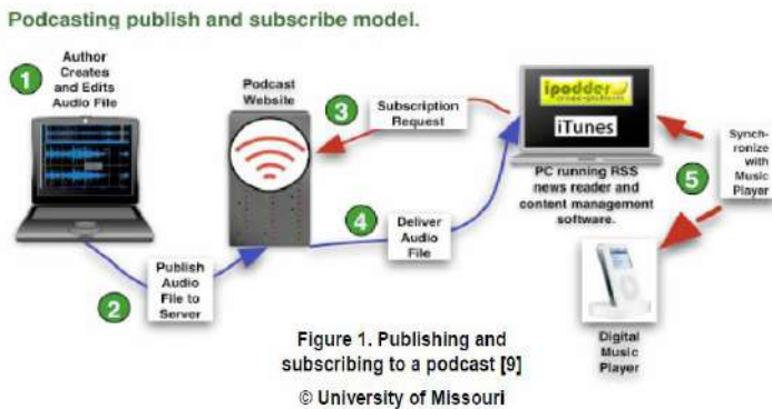
Figure 3. Complete process of podcast publishing

extension tags. The text editor is needed to achieve this by using code to create an RSS tag (Pettersen, 2006). The next step is the audio is published by the server. After producing audio podcast, the content of audio can be downloaded by anyone. They only subscribe to RSS and download the audio that they need and transfer into their tool like iPod or smartphones. This figure showed the complete process of producing unit consuming audio podcast.