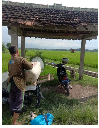
Figure 4. Sub Aspect 11 Field Ergonomic Checkpoints

3. Using Warning Signals that are Simply and Correctly Understood by Farmers Sub Aspect 43 of the Ergonomic Checkpoints list must present warning indicators that workers quickly and accurately recognize. The current situation does not match these criteria. There are no warning flags or anything of the sort presently. Another issue is that they have