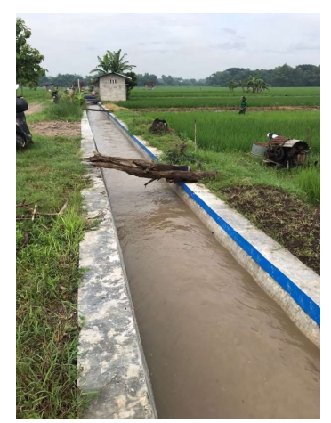
Figure 2. Sub Aspect 4 Field Ergonomic Checkpoints