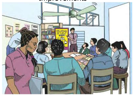
Figure 8. Recommendations for Sub Aspect 99 Improvements

not provided a warning sign of risk when spraying pesticides; this is contrary to the work environment assessment, which indicates that adjustments must be made.