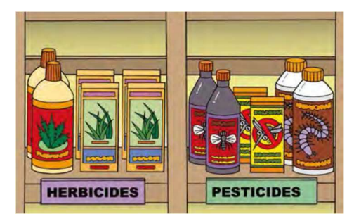
Figure 6. Recommendation for Sub Aspect 43 Improvements