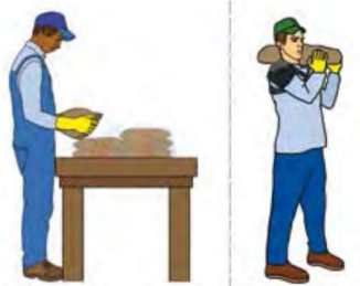
Figure 5. Recommendation for Sub Aspect 11 Improvements