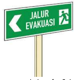
Figure 7. Recommendations for Sub Aspect 83 Improvements