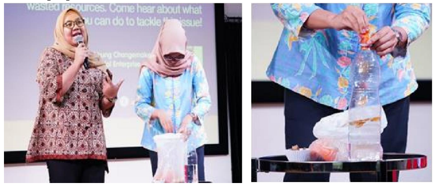
Fig 4. Workshop DIY Eco enzyme with citrus peels and apple pomace 3.2. Online Challenge #MelawanFoodWaste

solids from 884 to 745, pH from 6.7 to 7.2, suspended solids from 121 to 47 hardness, and chlorides [51].