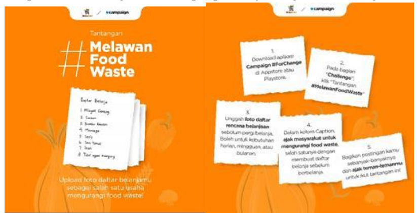
Fig 3. Poster of challenge #MelawanFoodWaste in Campaign #ForChange