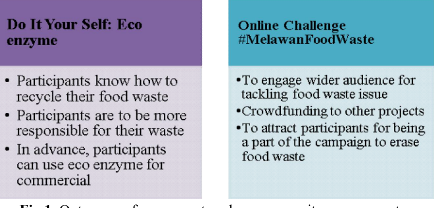
Fig 1. Outcomes of programs to urban community engagement

(right), as well as y-axis of main categories, non-governmental organization (NGO's) (top) and startups/private sectors (bottom) [23].