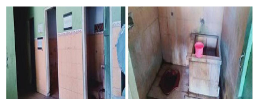
Fig 3. Waste Disposal Sites (WDS) Toilet

Based on table 4, it is known that, there are sanitation facilities (toilet) in Waste Disposal Sites (WDS), there are no separate toilets between women and men, clean water is available, there are bathrooms, there are latrines, but there are no toilets, sinks, the number of bathrooms exceeds the comparison with the number of toilets. worker. And this is documentations in Waste Disposal Sites (WDS):