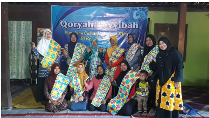
Picture 1. Shibori Batik Training Activities

Skills training to increase members' economic income is carried out in several forms of training that are suitable for women's skills. The training that has been carried out is training on making Shibori batik, sewing training, training on making trasi crackers, various wet and dry cakes and making dumplings. In addition to training, members are taught entrepreneurship that can be a source of economy, such as catfish farming, growing hydroponic plants and so on.