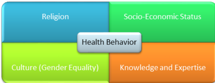
Picture 2. Factors influencing actions in public health

In addition, the health sector is an area of work on Qoryah Thayyibah since several factors affect public health conduct, including beliefs (religion), values, expertise, knowledge and abilities, and the culture of both individuals and families. In the table below, these factors can be described: