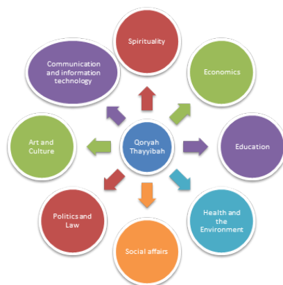
Graph 2. Qoryah Thayyibah 's Field of Work

The focus of Qoryah Thayyibah is based on the potential and critical issues faced by the target villages, such as spirituality, economics, education, social affairs, health and environment, politics and law, communication and information technology, as well as other fields in line with local circumstances. 9