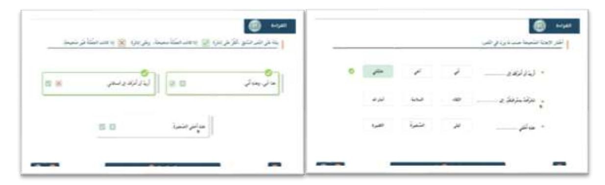
Figure 4. Reading Material Exercise

Fourth, exercises from the reading text, which involve answering questions related to the previous reading. These exercise questions are used to ensure the extent to which participants