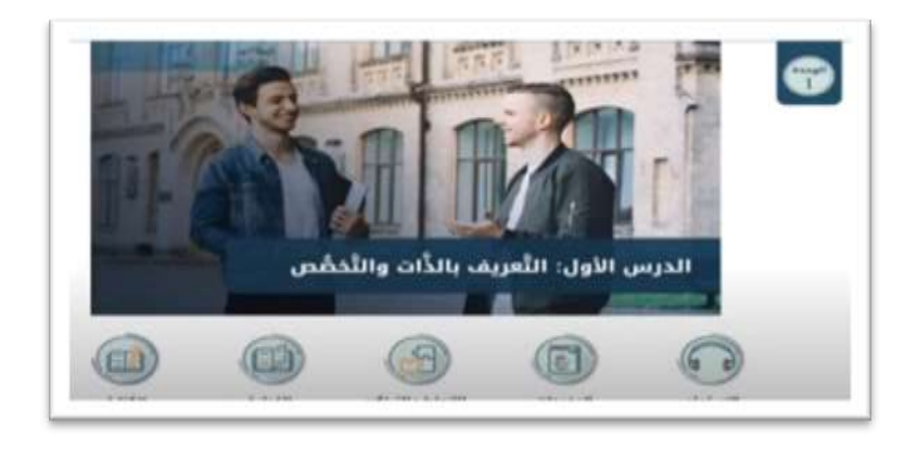
Figure 1. Arabic Language Skills Material

Within the "Arabic-Online.net" application, there are four language skills: listening, reading, speaking, and writing, as well as Arabic grammar rules (Alowaydhi, 2016). However, currently, all participants are unable to engage in the speaking skill instruction, as speaking materials are only available in scheduled online classes. Nevertheless, the other three language skills can assist learners in improving their Arabic language proficiency, supported by the application of appropriate Arabic grammar rules based on their language level.