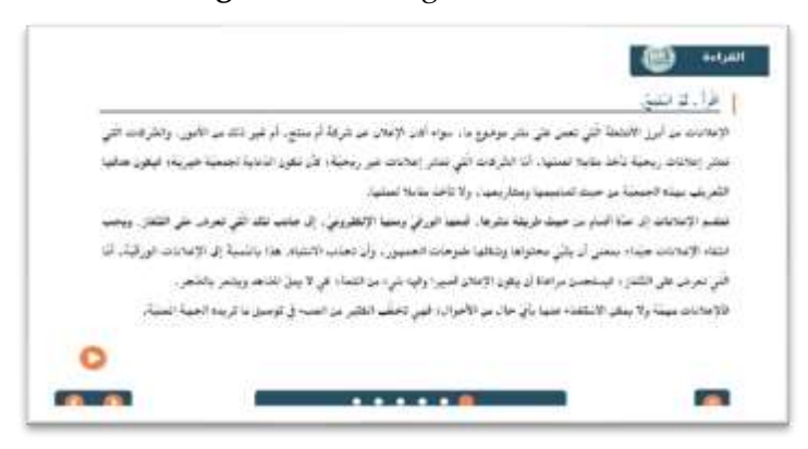
Figure 3. Reading Material

Second, exercises on vocabulary, which involves providing practice questions related to the newly learned vocabulary. These exercises include connecting words, filling in blanks with available words, and completing sentences that are not yet perfect with the new vocabulary. From these exercises, participants are expected to apply or practice what they have learned.