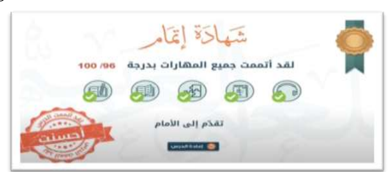
Figure 2. Assessment of Exercise Questions in the Material

Furthermore, upon successfully completing a unit of thematic instruction, participants will receive a certificate that includes their learning performance assessment. If the attained score meets the expected criteria, the learning can progress to the next level. Conversely, if the score falls below the standard, it is recommended to review and repeat the instruction at the same level.