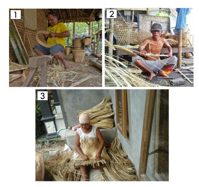
Figure 1. The activity in the woven bamboo industry: (1) Making hard-shaped product frame, (2) Making sharpened and Mashed-bamboo sheets, (3) Waving bamboo sheets

and working period among woven bamboo craftmens in Mojorejo Village. The results of this study could represent how workers in traditional creative industries are exposed to occupational risks that may affect their quality of life. It is hoped that further research or programs could determine the appropriate interventions to be applied based on the problems faced by SME's workers.