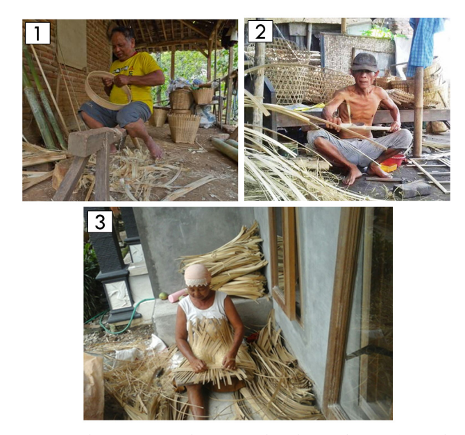
Figure 1. The activity in the woven bamboo industry: (1) Making hard-shaped product frame, (2) Making sharpened and Mashed-bamboo sheets, (3) Waving bamboo sheets

and working period among woven bamboo craftmens in Mojorejo Village. The results of this study could represent how workers in traditional creative industries are exposed to occupational risks that may affect their quality of life. It is hoped that further research or programs could determine the appropriate interventions to be applied based on the problems faced by SME's workers.