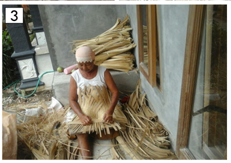
Figure 1. The activity in the woven bamboo industry: (1) Making hard-shaped product frame, (2) Making sharpened and Mashed-bamboo sheets, (3) Waving bamboo sheets