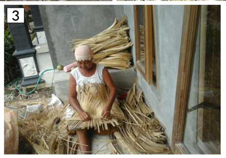
Figure 1. The activity in the woven bamboo industry: (1) Making hard-shaped product frame, (2) Making sharpened and Mashed-bamboo sheets, (3) Waving bamboo sheets