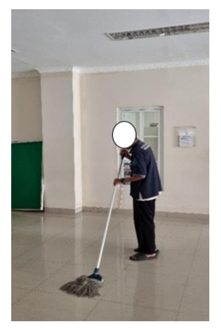
Figure 2. Sweeping floor activity

Cleaning service workers perform various duties such as sweeping, mopping, and cleaning tables/windows. The duties are conducted by using work tools or machines. The working tools used are brooms, mops, buckets, floor-cleaning brushes and others. The interaction between cleaning service workers and work tools negatively impacts the body. Workers' physical conditions, such as static postures while doing the job, may pose a risk of injury to the musculoskeletal system, including excessive fatigue, muscle injury, and other physical complaints (Iridiastadi & Yassierli, 2017). Figures 2 and 3 are examples of cleaning service activities, showing the interaction between workers and work tools.