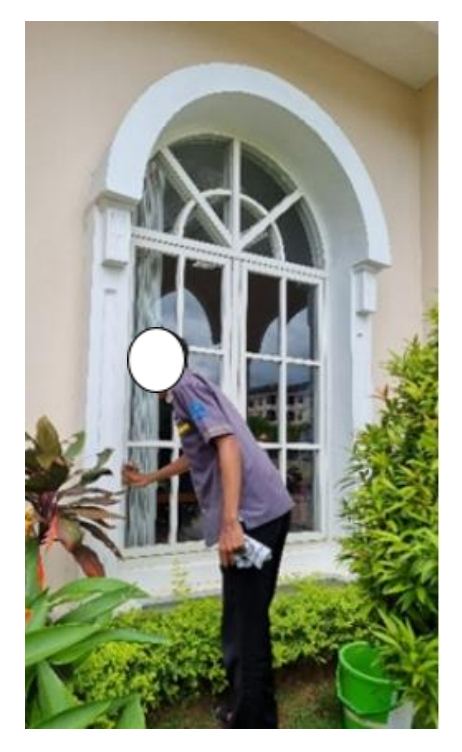
Figure 3. Wiping the window activity

These activities are shown in Figures 2 and 3, potentially can cause muscle injury due to non-ergonomic work postures. These activities repeatedly are done every day for six days a week. These repetitive motions need bending, twisting, and bowing movements. Further, these movements involve excessive muscle work because it needs to be more ergonomic.