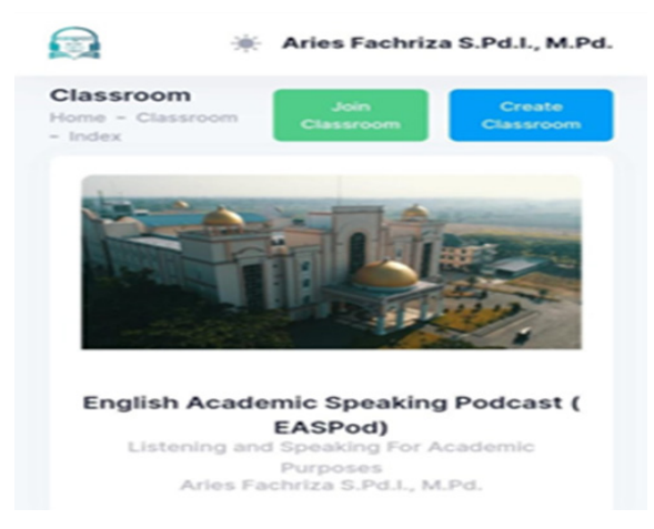
Figure 1. EASPod display in computer

activities that emphasized to students' fluency and pronunciation (Baratova, 2023). This will assist the listener to identify the word or sentence by podcaster.