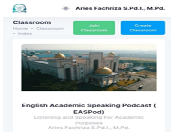
Figure 1. EASPod display in computer

activities that emphasized to students' fluency and pronunciation (Baratova, 2023). This will assist the listener to identify the word or sentence by podcaster.