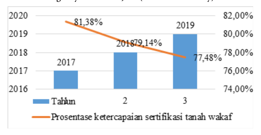
Figure. 2: Waaf Land Certification Percentage Curve on Magelang Regency of Central Java (After PTSL Policy)

The percentage of waqf land certification at Magelang Regency after the issuance of PTSL policy by the Minister of Spatial Planning/Head of National Land Agency can be explained in the following curve.