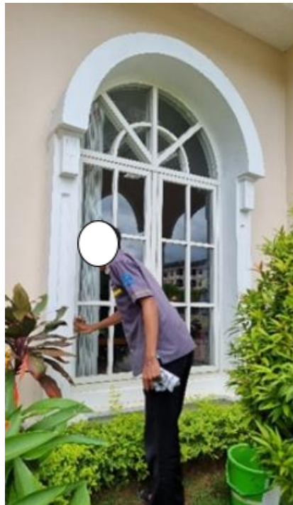
Figure 3. Wiping the window activity

These activities are shown in Figures 2 and 3, potentially can cause muscle injury due to non-ergonomic work postures. These activities repeatedly are done every day for six days a week. These repetitive motions need bending, twisting, and bowing movements. Further, these movements involve excessive muscle work because it needs to be more ergonomic.