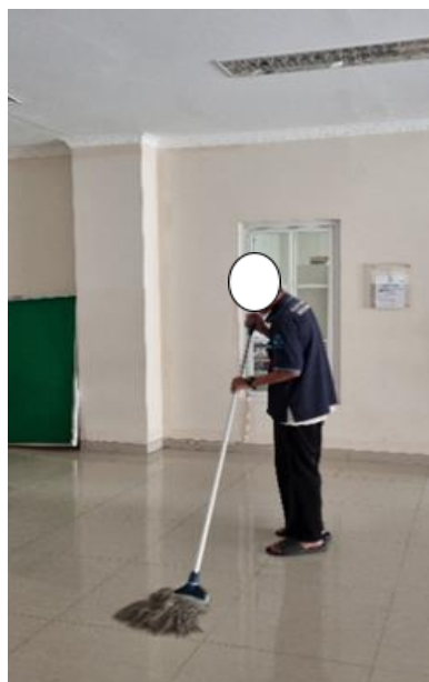
Figure 2. Sweeping floor activity

Cleaning service workers perform various duties such as sweeping, mopping, and cleaning tables/windows. The duties are conducted by using work tools or machines. The working tools used are brooms, mops, buckets, floor-cleaning brushes and others. The interaction between cleaning service workers and work tools negatively impacts the body. Workers' physical conditions, such as static postures while doing the job, may pose a risk of injury to the musculoskeletal system, including excessive fatigue, muscle injury, and other physical complaints (Iridiastadi & Yassierli, 2017). Figures 2 and 3 are examples of cleaning service activities, showing the interaction between workers and work tools.