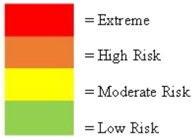
Figure 1 Description:

The risk Matrix in Figure 1 describes the risk level of the most severe occupational accidents so that the result can be used as guidance to set a priority scale in taking improvement (Ada & Hambali, 2020; Trisaid, 2020).