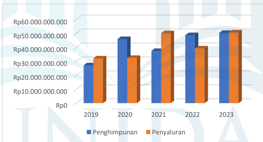
Figure 2. Total Collection and Distribution of Zakat, Infaq/Sedekah Funds (2019-2023)

Source : West Java BAZNAS Financial Report 2019-2023